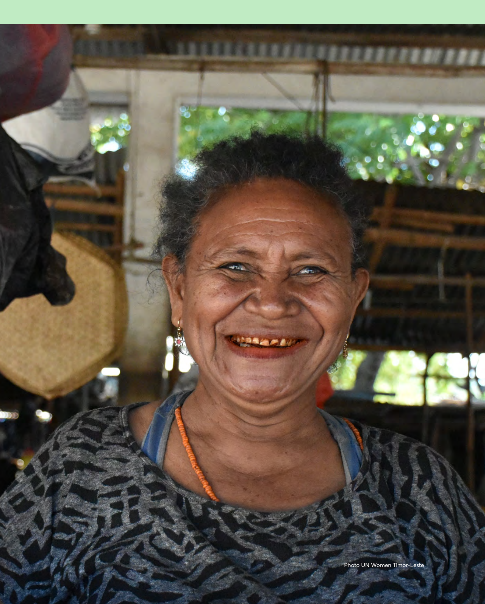
ANNEX 04: SPECIFIC RECOMMENDATIONS FOR THE 4 PILLARS OF NAP 1325