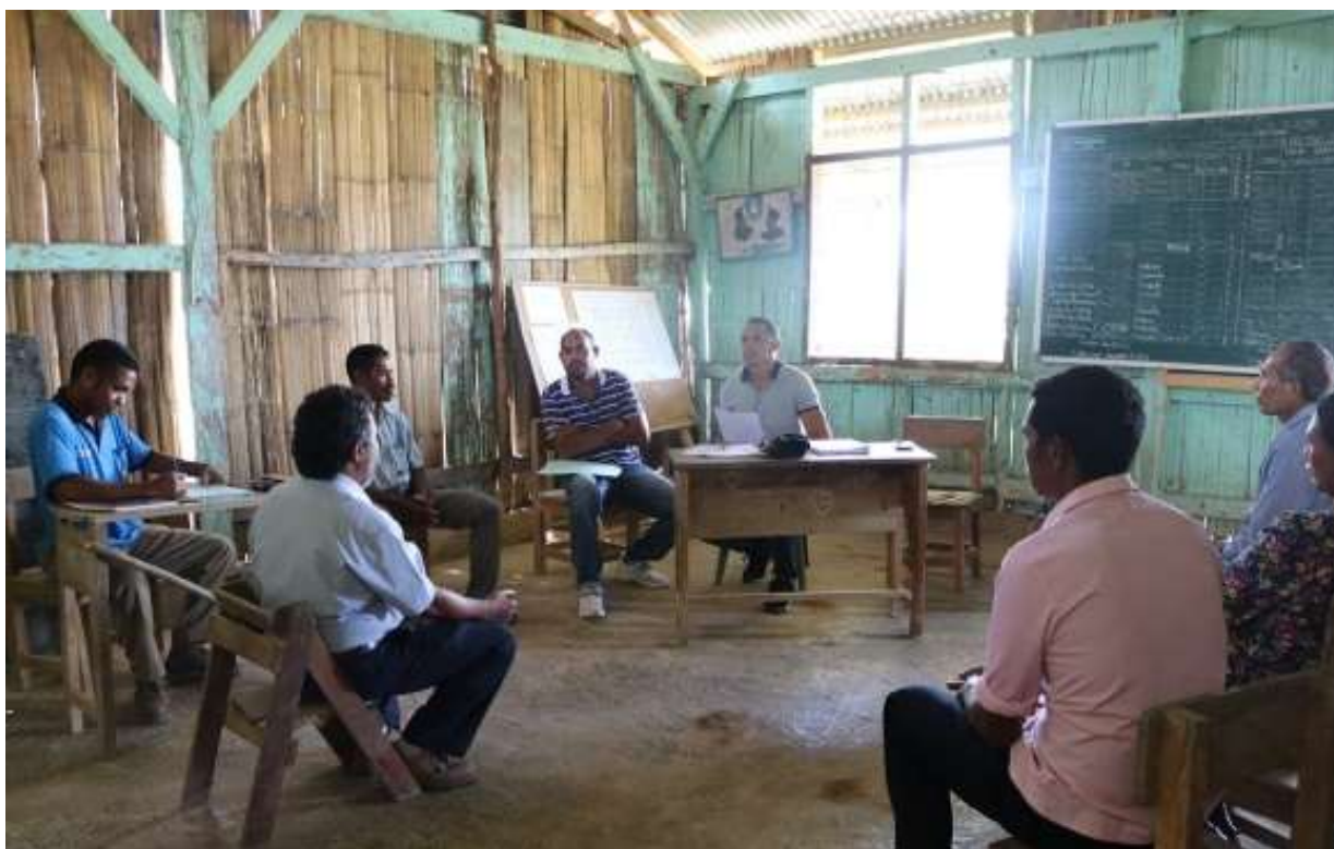
Figure 6. The Scoping mission team (from the MEYS and CDT-TL) meeting with the teachers from the General Secondary School of Iralere-Uatolari Vieaqueae

As a result, a total of 165 Secondary Schools (108 of General Secondary Schools – 39 Public, 12 private and 44 Catholic schools; and 58 of Technical Vocational Schools – 40 Public, 13 Private and 5 Catholic schools) in Timor-Lest were visited; more than 180 meetings were held with the secondary schools leaders and teachers and education municipal authorities to informed about the School Census Survey that will be conducted by IBTCI through its local partner NGO Belun; around 4,700 copies of instruments were distributed to the 4,442 school leaders and teachers