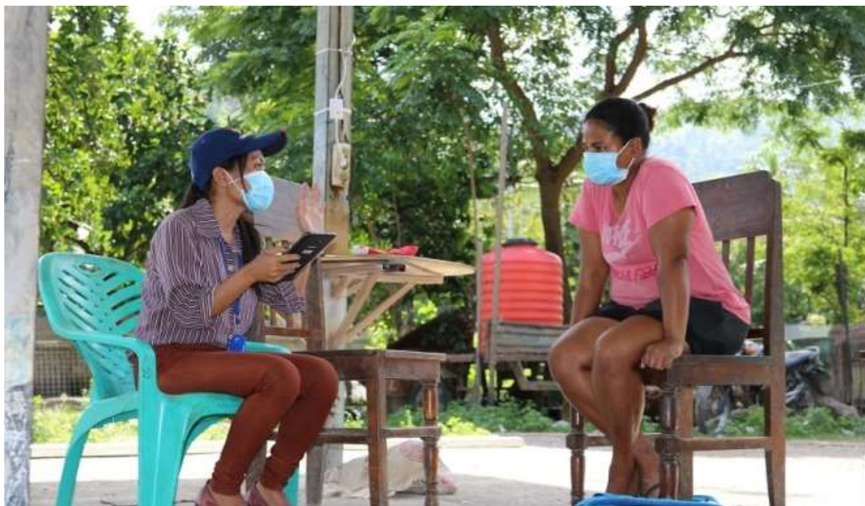
Figure 9. An enumerator interviewing a household in Dili to understand water & waste management in the community in Dili on December 23, 2020

In December 7 – 11, 2020, the CDT-TL provided technical assisting to the local Belun to conduct the Key Informant Interview (KII) for the SBC research. This aimed to ensure that the enumerators understand and can use the KII tools to interview the targeted sample households. Further, in December 14 – 22, 2020, CD-TL participated in the SBC survey in Dili. This was to ensure that the enumerators were able to collect a good data throughout the survey and KII with the selected samples of households.