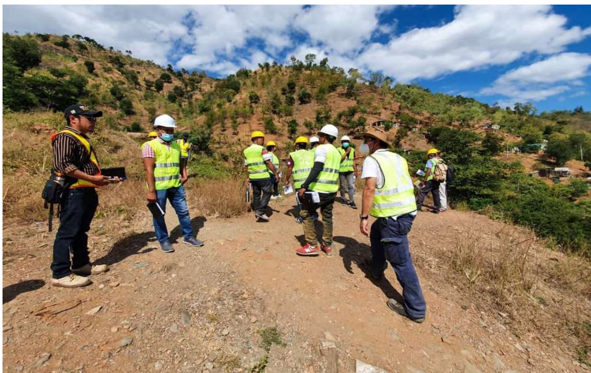
Figure 3. The CDT-TL joining the CAIA team for site inspection

On October 22, the CDT-TL participated in the presentation of the preliminary result from the document assessment on the environmental impact on the Dili drainage infrastructure project. The presentation was prepared by the CAIA and the commission indicated that the Dili drainage infrastructure project fall into environmental impact category A 2 . Later in 22 nd December, the CDT-TL participated in the presentation of the final result of assessment of the environmental impact and environmental management plan documents for Dili Drainage Infrastructure Upgrading project. This presentation was also conducted by the CAIA, and by attending it, this has enabled the CDT-TL to update and understand the result of the environmental impact assessment results and allowed the team to update the ongoing feasibility study for the WTSD project to the KIAA team. By having all of this information, the CDT-TL will be able to share the important information with the MCC team.