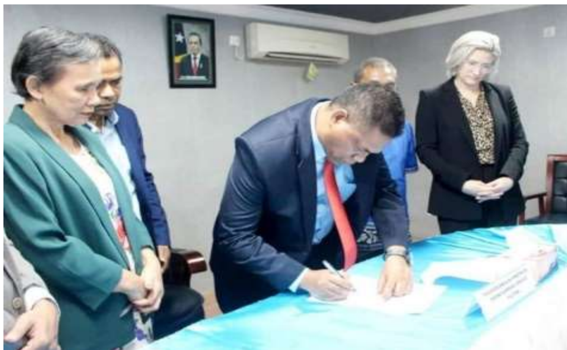
Figure 5. The Minister of Higher Education, Science and Culture, H.E. Longuinhos dos Santos signing the Term of Reference

To assist the design of the Education project in Timor-Leste, the MCC and CDT-TL team have developed the scope of work to do the feasibility study for the project. In the 30 th of January 2020, CDT-TL and MCC met with H.E. Longuinhos dos Santos, the Minister of Higher Education, Science and Culture and H.E. Dulce de Jesus Soares, the Minister of Education, Youth and Sports to discuss and sign the Terms of Reference (ToR) for the scope of work that would support the feasibility study for the Education project. The ToR covered the following tasks: Develop the design of a Center of Excellence; Pre-service education and training for teachers and school leaders; In-service teachers and school leaders training and professional development; Revision of the secondary education curriculum; and Propose design and Gender and Social Inclusion Analysis and Integration.