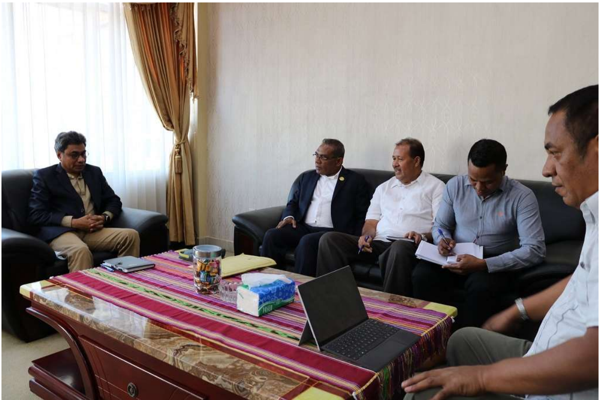
Figure 1. The CDT-TL meeting with the Vice-Prime Minister and Minister of planning and Territory, H.E. Jose Reis on July 21, 2020

In early July 2020, the CDT-TL initiated meetings with current and newly appointed members of government, including the two Deputy Prime Ministers. The main objectives of the meetings were to introduce and update the Compact Program development process and its progress. In those meetings, the CDT-TL requested the new Ministers to appoint their Focal Points who can support and facilitate the coordination between the CDT-TL and the line ministries. The CDT-TL also highlighted that the Focal Points play an important role in facilitating the coordination between CDT-TL, the line ministries and the Cabinet of Ministers in supporting the development of Compact Program. In responding to the CDT-TL's request, most of the new Government Members have responded positively, and they were committed to support the Compact development process in Timor-Leste as they were aware of the importance of the MCC investments on the WTSD and Education Projects in Timor-Leste. As a result of the meetings, the CDT-TL has received the list of appointed focal points from the line ministries and requested each focal point to facilitate the coordination between the CDT-TL and each of Ministers' offices.