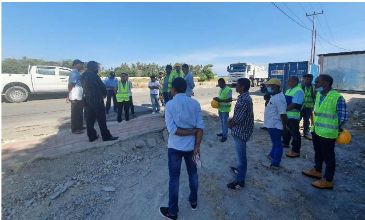
Figure 4. The CDT-TL joining the ITG team for resettlement activity

recommendations for the resettlement. The ITG is composed of the MPW, MSA, Ministry of Justice (Secretary of State for Land and Property (SETP), Ministry of Agriculture and Fisheries and the Ministry of Interior (Mol), and the MPW is coordinating this group.