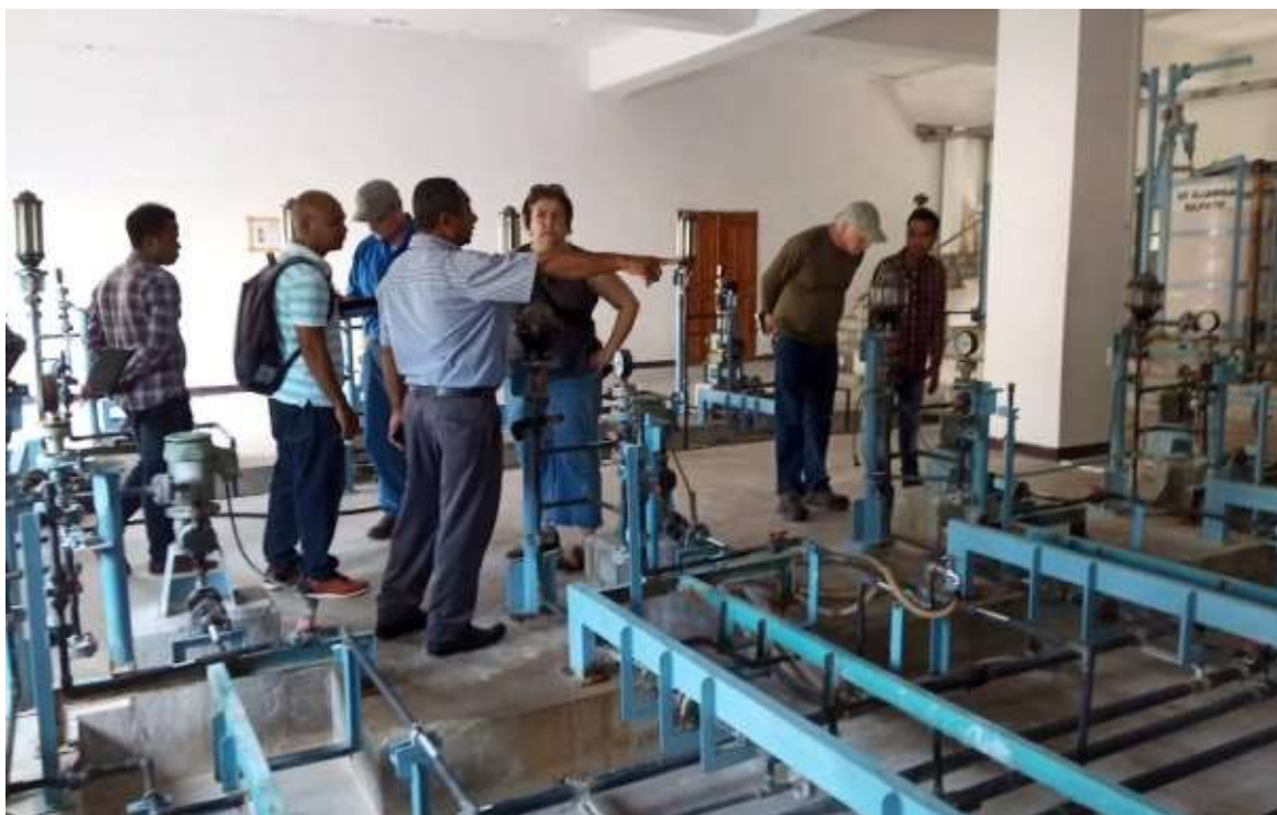
Figure 2. The CDT-TL and Tetra Tech consultant visiting the clean water treatment station in Cacaolidun, Dili on February1, 2020

To support the feasibility study, the CDT-TL also made a request to the DGAS – MPW to authorize TPF Timor, a construction engineering Company who is the sub-contractor of Tetra Tech, to do a site visit to the existing public boreholes in Dili and the water treatment plant facility outside of Dili. As a result, the TPF was authorized to do the site visit and they were able to get the information related to the existing water supply and water treatment plant facilities in Dili and outside of Dili. The CDT-TL continued to collect additional information requested by MCC and the Tetra Tech firm too. The CDT-TL met several Directorates at the MPW, such as the General Directorate of Electricity to obtain the data on the capacity of the electric power network; the National Directorate of Water Resources Management (DNGRA) to get any information or document related to Dili ground water resources; and the National Directorate of Water Service (DNSA) to get the data on Household consumption on clean water. The CDT-TL also met the MoH to obtain the water quality data in Timor-Leste. Both government ministries were keen to share the information and the requested data have been shared with the MCC and Tetra Tech for further analysis.