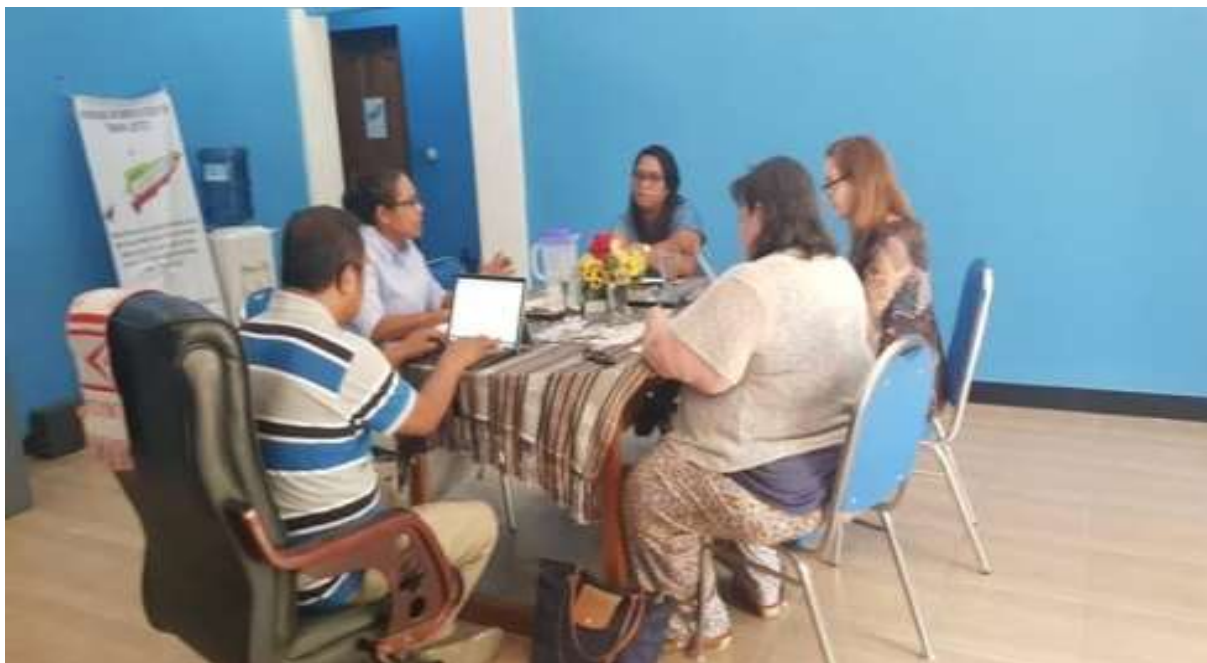
Figure 8: The CDT-TL and MCC meeting with Rede Feto

improvement, it would lead to an automatic down grade to Tier III 5 and a suspension of aid. More importantly, given that Timor-Leste is a source, transit and recipient of trafficked persons, the Environment and Social Impact Assessment (ESIA), resettlement and construction contracting will need to anticipate and proactively manage both TIP and GBV risks.