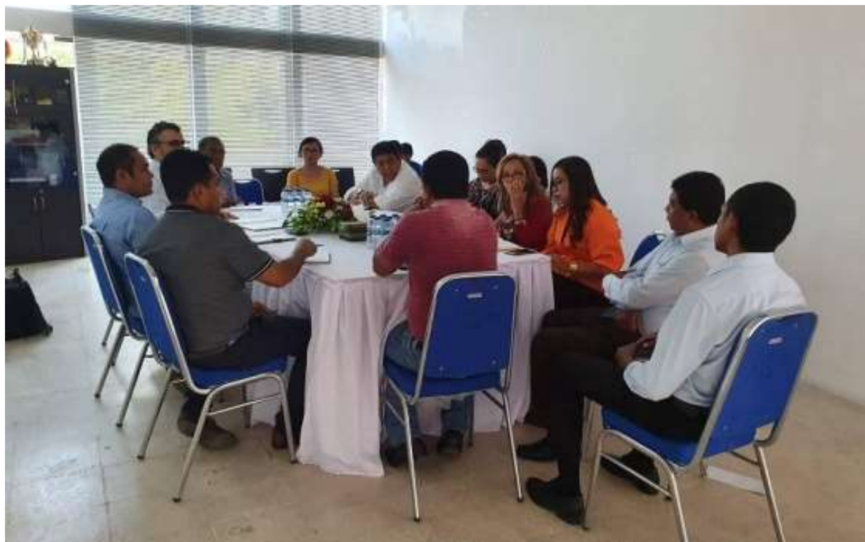
Figure 10. The CDT-TL & Tetra Tech consultant meeting with Chamber of Commerce and Industry of Timor-Leste (CCI-TL) on March 13, 2020

Further, on December 21, 2020, the CDT-TL had a meeting with the Executive Board of the CCI-TL, Vice President of CCI-TL, and the CEO of CCI-TL at the CCI-TL office. The objectives of the meeting were to inform the private sector regarding the progress of Compact Development