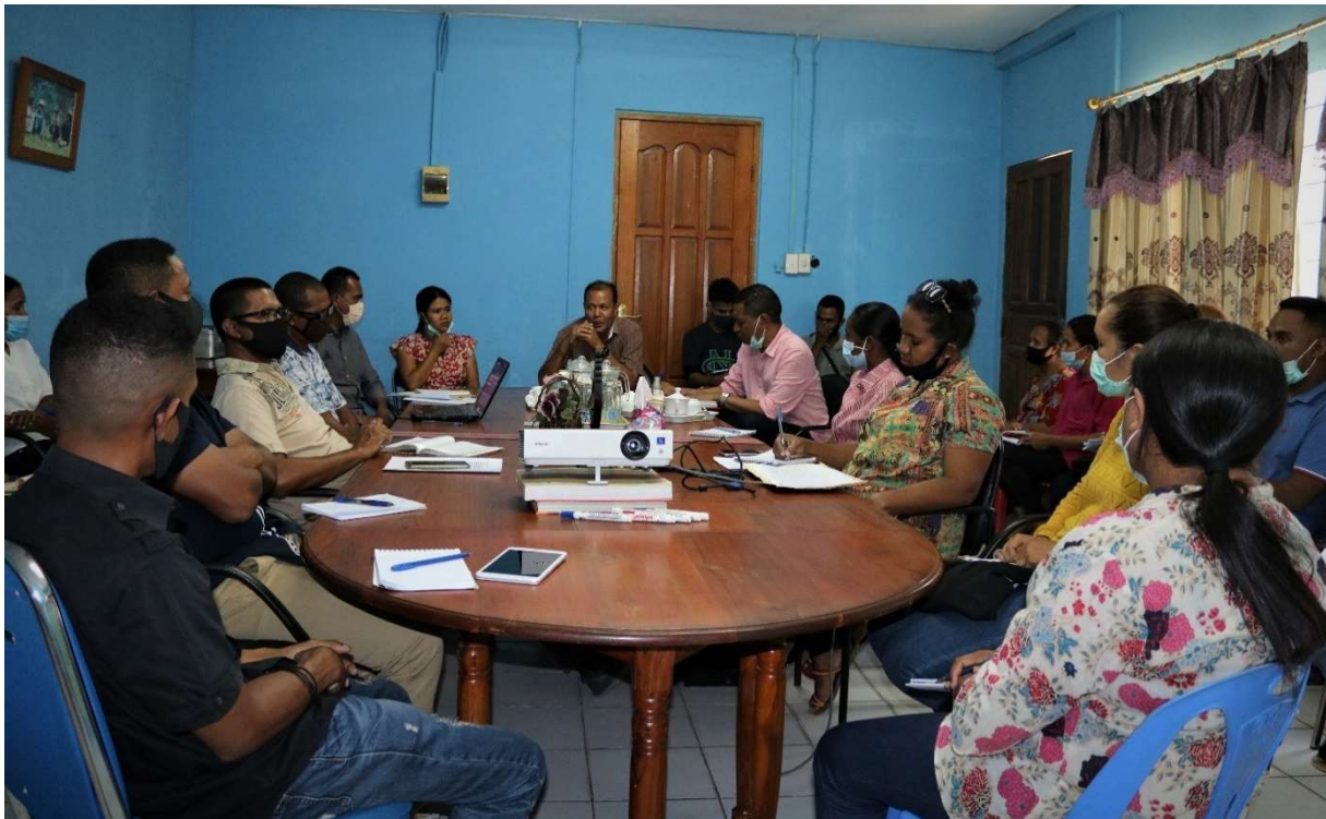
Figure 7. The Deputy of National Executive Director from the CDT-TL providing a brief description about the school census survey to the enumerators from Belun on October 14, 2020

In mid-October 2020, the data collection for the school census and survey was finally conducted by Belun enumerators under a close supervision of the Bridging People and IBTCI right after the Scoping Mission. The Bridging People and its sub-contractor NGO Belun led the entire school census and surveys process while the CDT-TL supported them by preparing all the necessary information for the school visit such as the updated school contact details as well as the ideal time to visit schools for the interview with the school leaders and teachers. The CDT-TL also assisted with providing some technical and strategic input during the training sessions for the Belun enumerators including revising the Tetum version of the survey instrument. This was intended to ensure the quality of data collection on school leaders and teachers at the school level. The CDT-TL's intervention helped to amend some process of the data collection that ensures effective, timely and robust data collection.